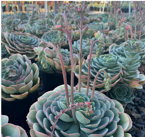
ECHEVERIA species 1G